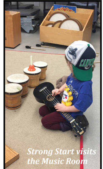
Strong Start visits the Music Room