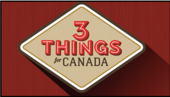
Martha Gerow Principal

In celebration of Canada's 150th birthday this year, Canadians have an opportunity to initiate over 100 million acts of service. Yes, if every man, woman and child in Canada completes 3 acts of kindness, Canadians will complete over 100 million acts of service. As the students bring in their 3 things, they will be posted up on the front bulletin